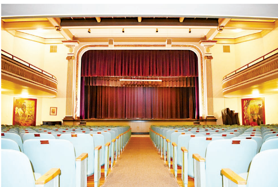
Ground level illuminated view of the Northumberland County Career and Arts Center auditorium.